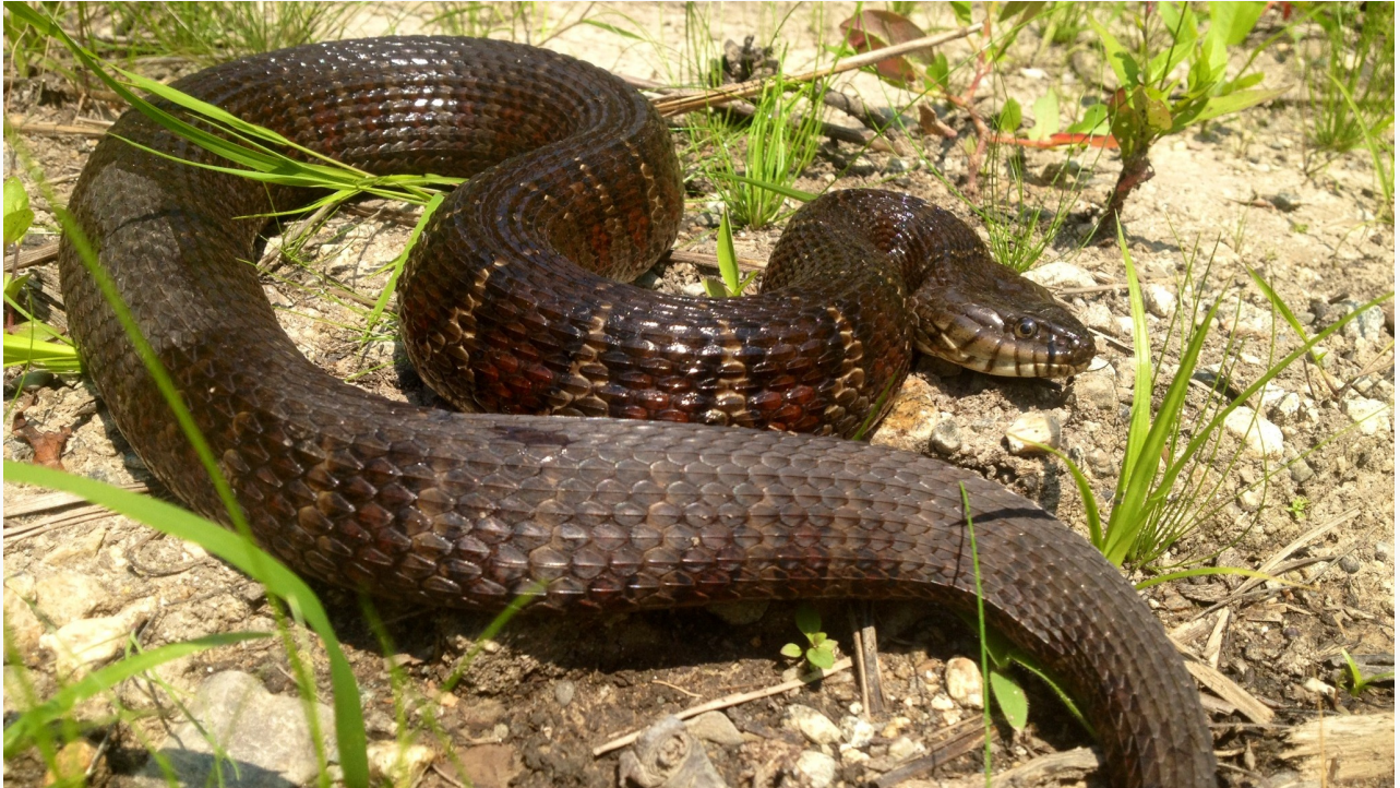
The common water snake and southern water snake are characterized by dark cross bands, which the native garter snake lacks.

Water snakes from the eastern United States are being found in